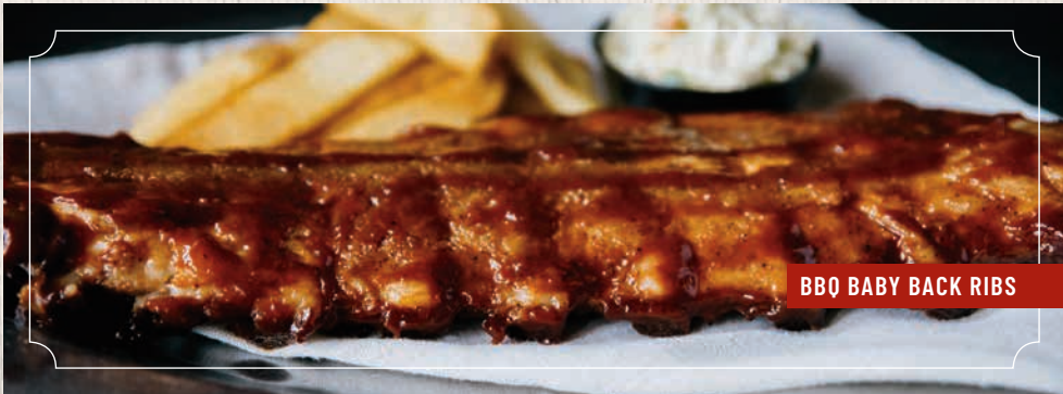
BBQ BABY BACK RIBS

Half slab ribs, hand breaded chicken fingers, and honey mustard. Served with choice of potato and coleslaw / 27.99