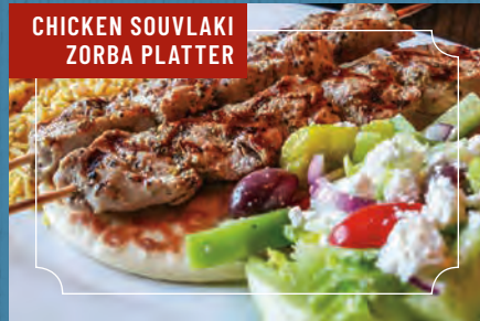
CHICKEN SOUVLAKI ZORBA PLATTER