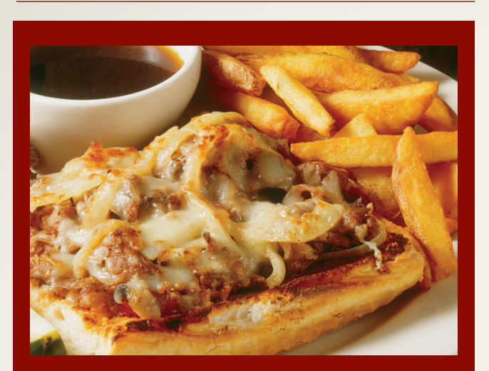
PRIME RIB GRINDER Thinly sliced prime rib, with grilled onions and mozzarella, on a toasted French roll. 13.99 When Available

Broiled flank steak sliced with sautéed onions and peppers, monterey jack cheese, on garlic French bread. 13.99