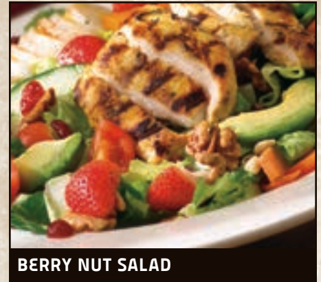
BERRY NUT SALAD

Tender filet mignon slices, bleu cheese, tomato, cucumber, red onion, carrots, over greens and choice of dressing. 13.99