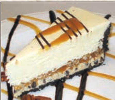
TURTLE COOKIE DOUGH ICE CREAM CAKE