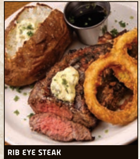
RIB EYE STEAK