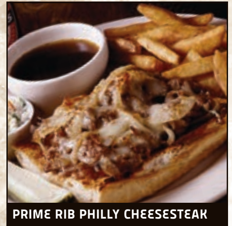
PRIME RIB PHILLY CHEESESTEAK