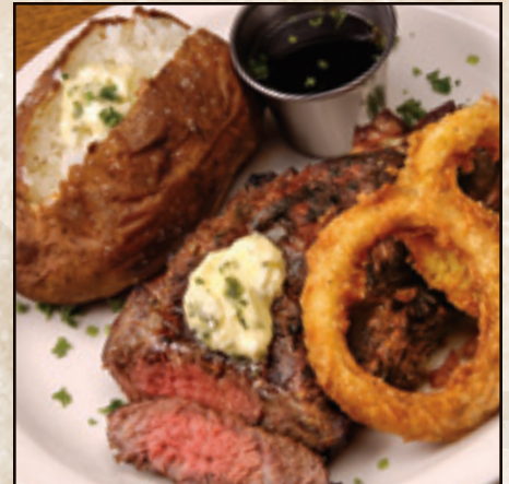
RIB EYE STEAK

Tender strips of chicken breast, breaded, deep fried and served with corn on the cob and honey mustard sauce. 11.99