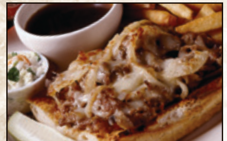
PRIME RIB PHILLY CHEESESTEAK

MELT ▪ Sautéed mushrooms and Swiss on rye bread