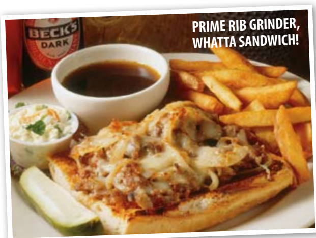
PRIME RIB GRINDER, WHATTA SANDWICH!