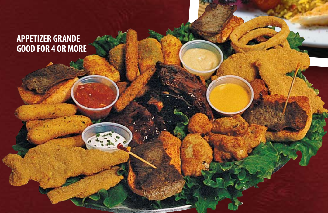
APPETIZER GRANDE GOOD FOR 4 OR MORE