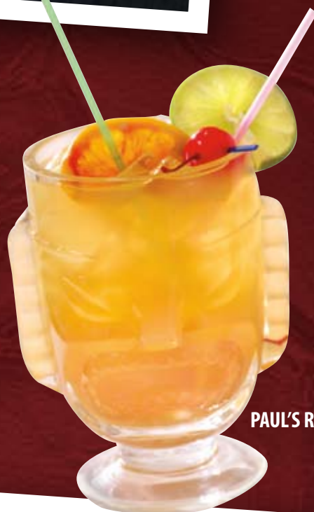
PAUL'S RUM BARREL