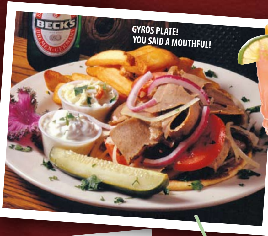
GYROS PLATE! YOU SAID A MOUTHFUL!