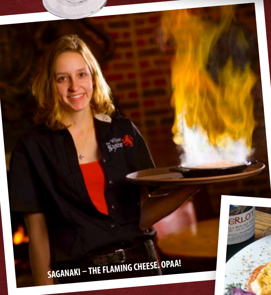
SAGANAKI – THE FLAMING CHEESE. OPAAI!