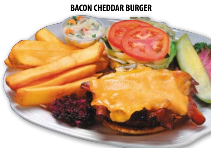
BACON CHEDDAR BURGER