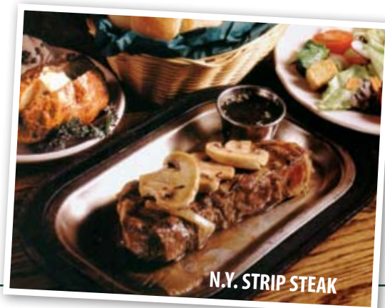
N.Y. STRIP STEAK

PRIME RIB It melts in your mouth. Served after 4 p.m. on Friday, Saturday and all day on Sunday.