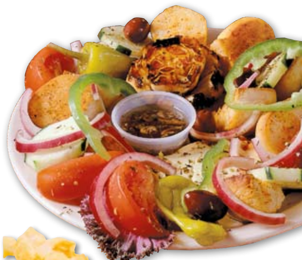
ROASTED GARLIC APPETIZER

Rainbow tortilla chips covered with nacho cheese sauce, chili, guacamole, sour cream, black olives, jalapeños and salsa. 8.99