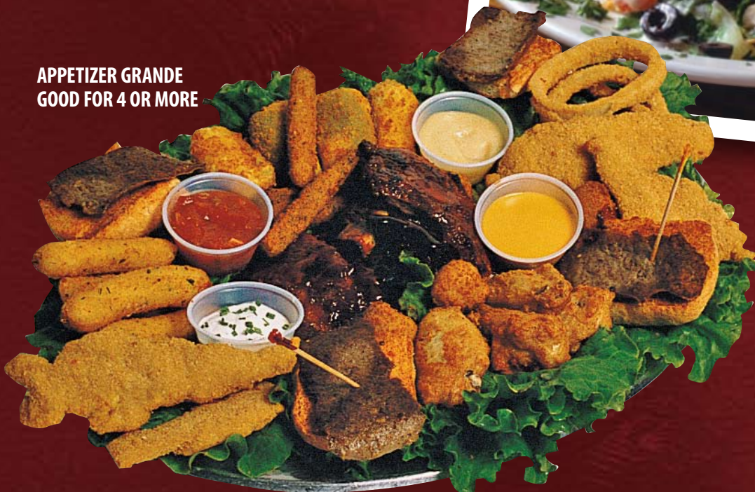
APPETIZER GRANDE GOOD FOR 4 OR MORE