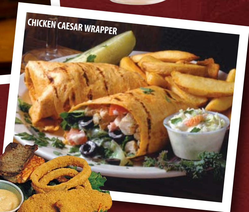
CHICKEN CAESAR WRAPPER