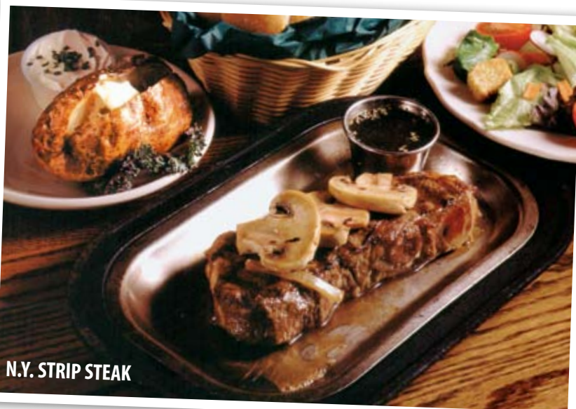
N.Y. STRIP STEAK