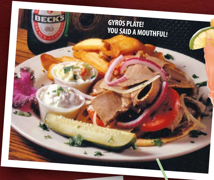
GYROS PLATE! YOU SAID A MOUTHFUL!