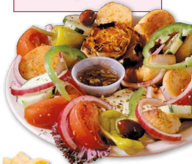
ROASTED GARLIC APPETIZER