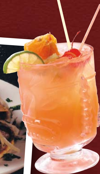
28 OZ. MAI TAI