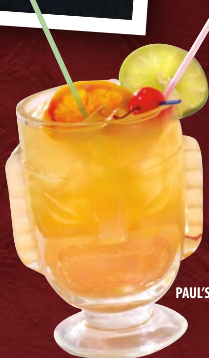
PAUL'S RUM BARREL