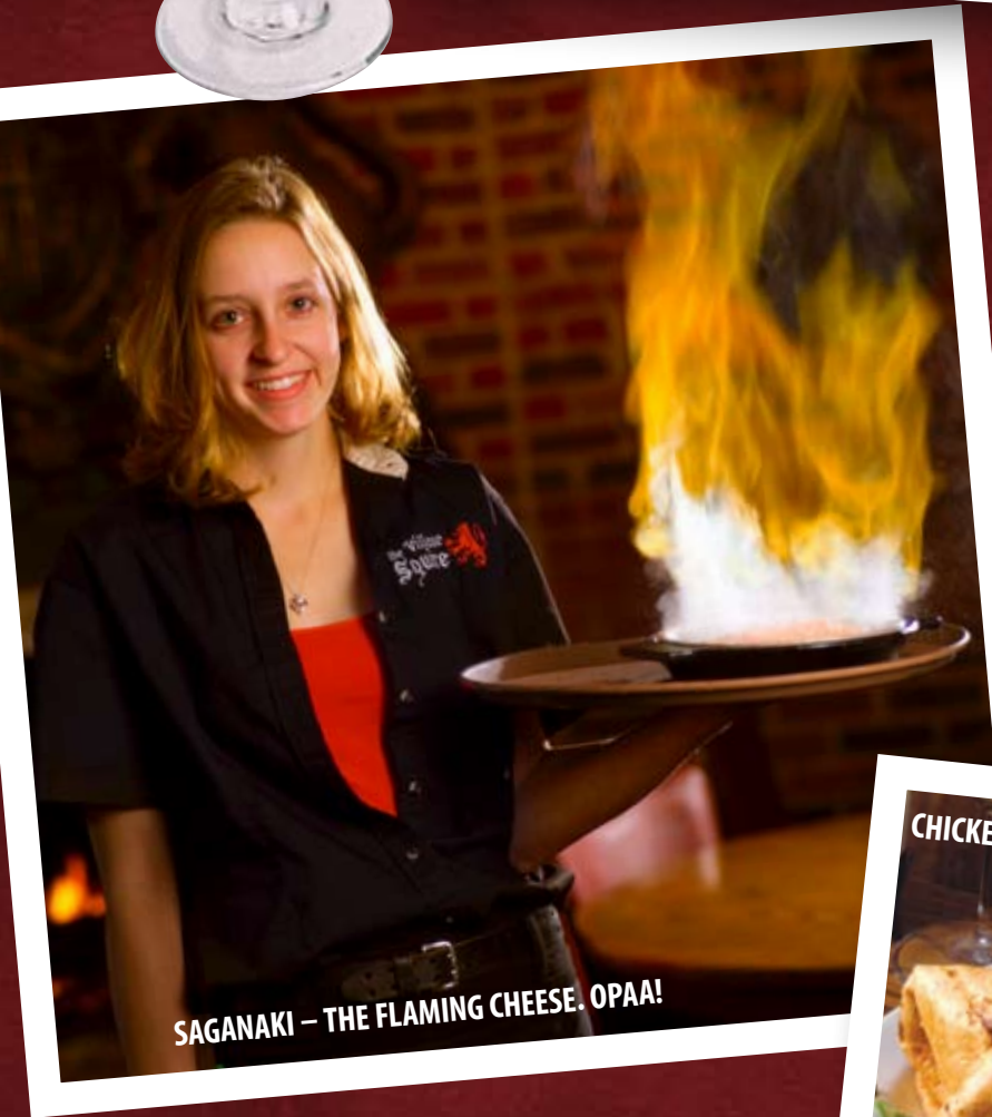
SAGANAKI – THE FLAMING CHEESE. OPAAI!